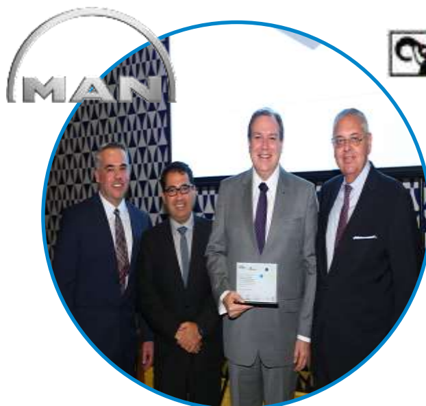
Excellence in Innovation