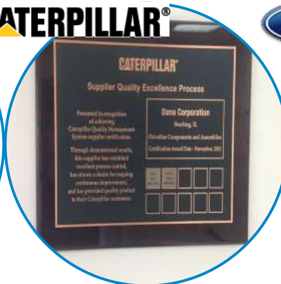
Supplier Quality Excellence