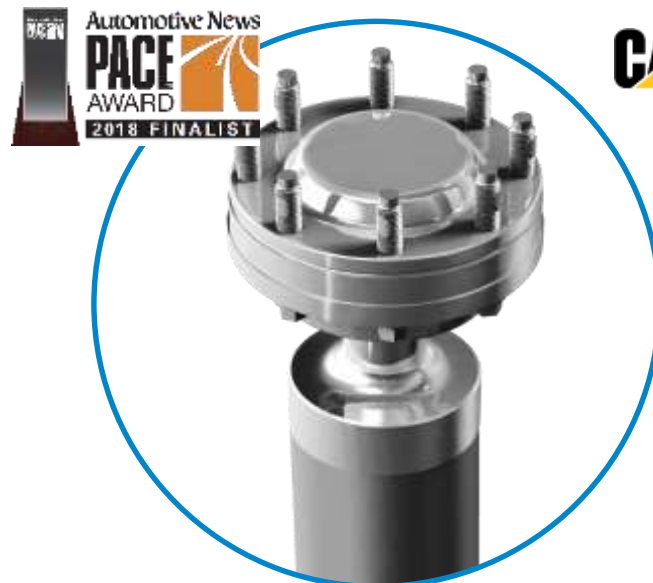
PACE Award Finalist