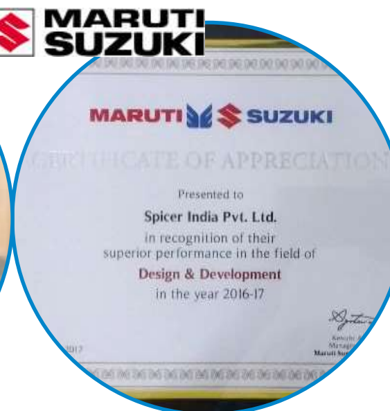
Design & Development