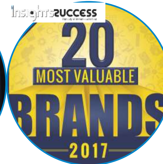
Most Valuable Brand