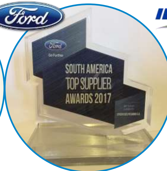
Top Powertrain Supplier